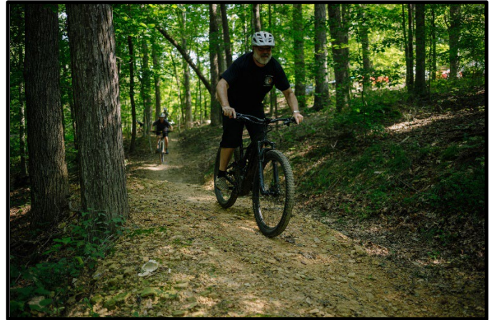
Mt. Biking @ Grand Opening