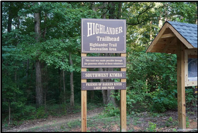
Trailhead Signage (Kelsie Hall, LRL PAO)