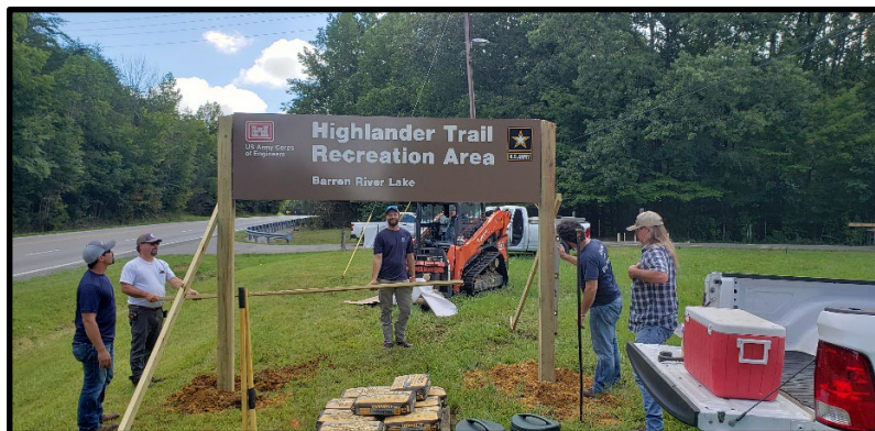
Recreation Area Sign Install by BRL Maintenance Staff

U.S. ARMY CORPS OF ENGINEERS – LOUISVILLE DISTRICT P.O. Box 59, Louisville, KY 40201-0059 www.lrl.usace.army.mil